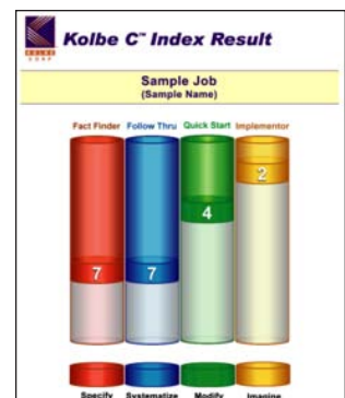
Kolbe C™ Index Results external requirements

Kolbe A Index = Our Reality Kolbe B Index = Self-Expectation Kolbe C Index = External Requirements