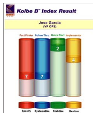
Kolbe B™ Index Results self-expectation